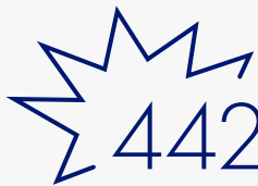
New advised UK Casualty Excess Claims in 2019