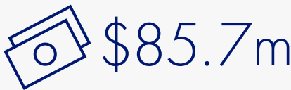
Paid out in UK Casualty Excess Claims in 2019