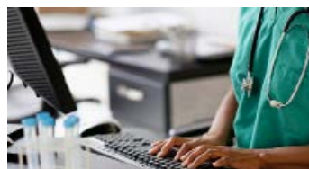
Healthcare & Life Science