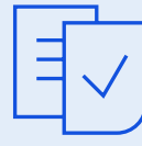
Letters of credit and trade related Standby Letters of Credit (SBLCs)