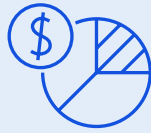
Trade loans (corporate and FI risk)