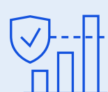
Asset-backed lending (Trade related)